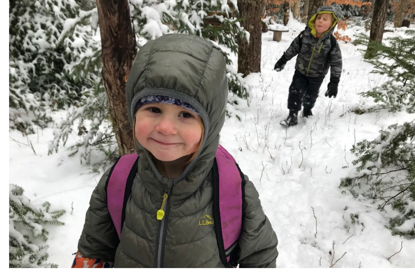
Children must be able to cary their own backpack with their extra gear

Please dress your children in play clothes for our program! Most of the art supplies and messy play we get into will wash off in the laundry. Some of the paint or glue we use (not to mention sap) may be hard to get out. Worry about getting dirty can get in the way of our important work and play.