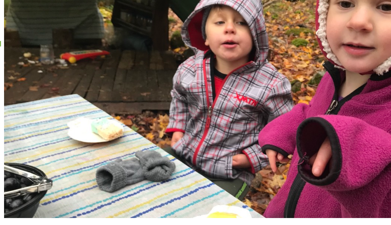
A snack is provided each day, usually fruit and a homemade muffin.

Should the above situations arise while at Forest School, parents will be contacted and the participant will be asked to picked up immediately.