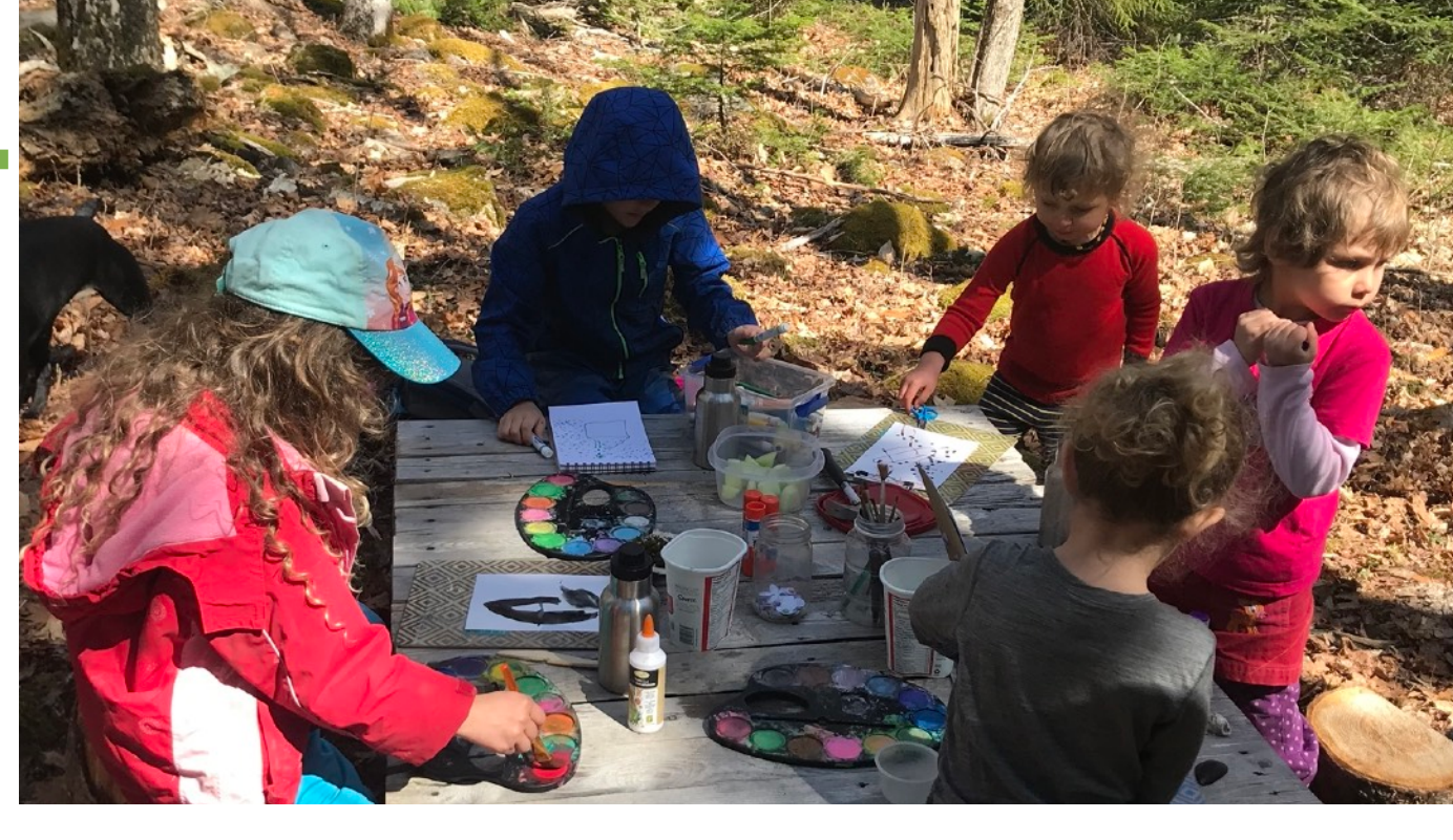
We aim to make our programs accessible to as wide a range of students as possible

It is our goal to make our programs financially accessible to everyone. If cost is preventing your family or someone you