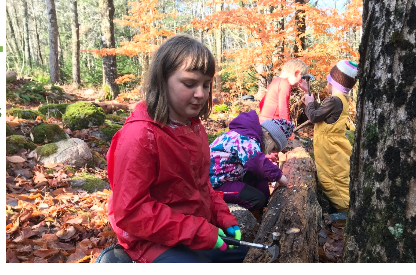
Some risk associated with our activities is inherent to our programs

Wild Wonders Forest School acknowledges that because we are set in a natural, mature forest, there is always an element of risk involved in our program. In fact, we at Wild Wonders believe that risk and risky play is an important element in learning! Risk assessment is a life skill that children can only learn with practice. We aim to provide many opportunities for this, within an age appropriate sphere. We encourage activities like running, puddle jumping, mud and snow sliding, tree climbing, tool use, building of forts and other play structures... just to name a few. Children and educators work together to decide what is a reasonable level of risk for each situation, group and child. We create our community